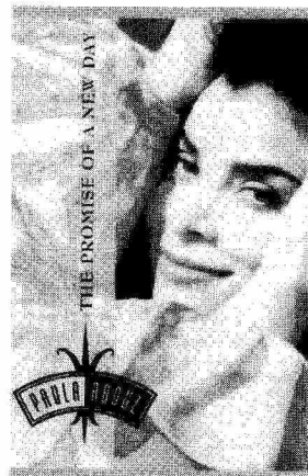
3. Paula Abdul 355